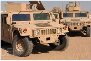
US ARMY HUMVEE

The following projects have been treated with DFI's hydrophobic protective coatings: