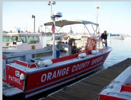
Orange County Sheriff Harbor Patrol