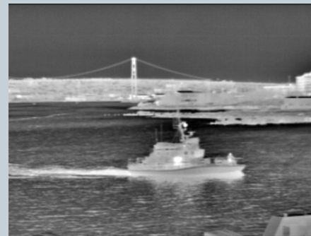
Night Navigator Current Corp