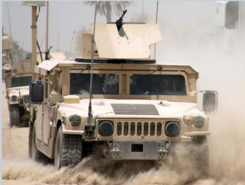
US Army Humvees Iraq & Afghanistan

Improves Safety & Extends the Useful Life of Glass Surfaces