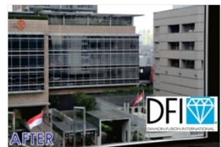
PULLMAN JAKARTA INDONESIA THAMRIN CBD HOTEL